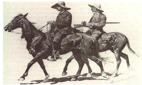
Cracker Cowboys, Remington